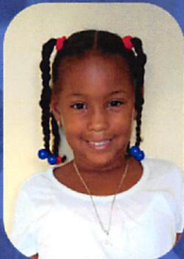
SHERLINE Dominican Republic

For only $40 a month, you can transform a child's life through sponsorship!